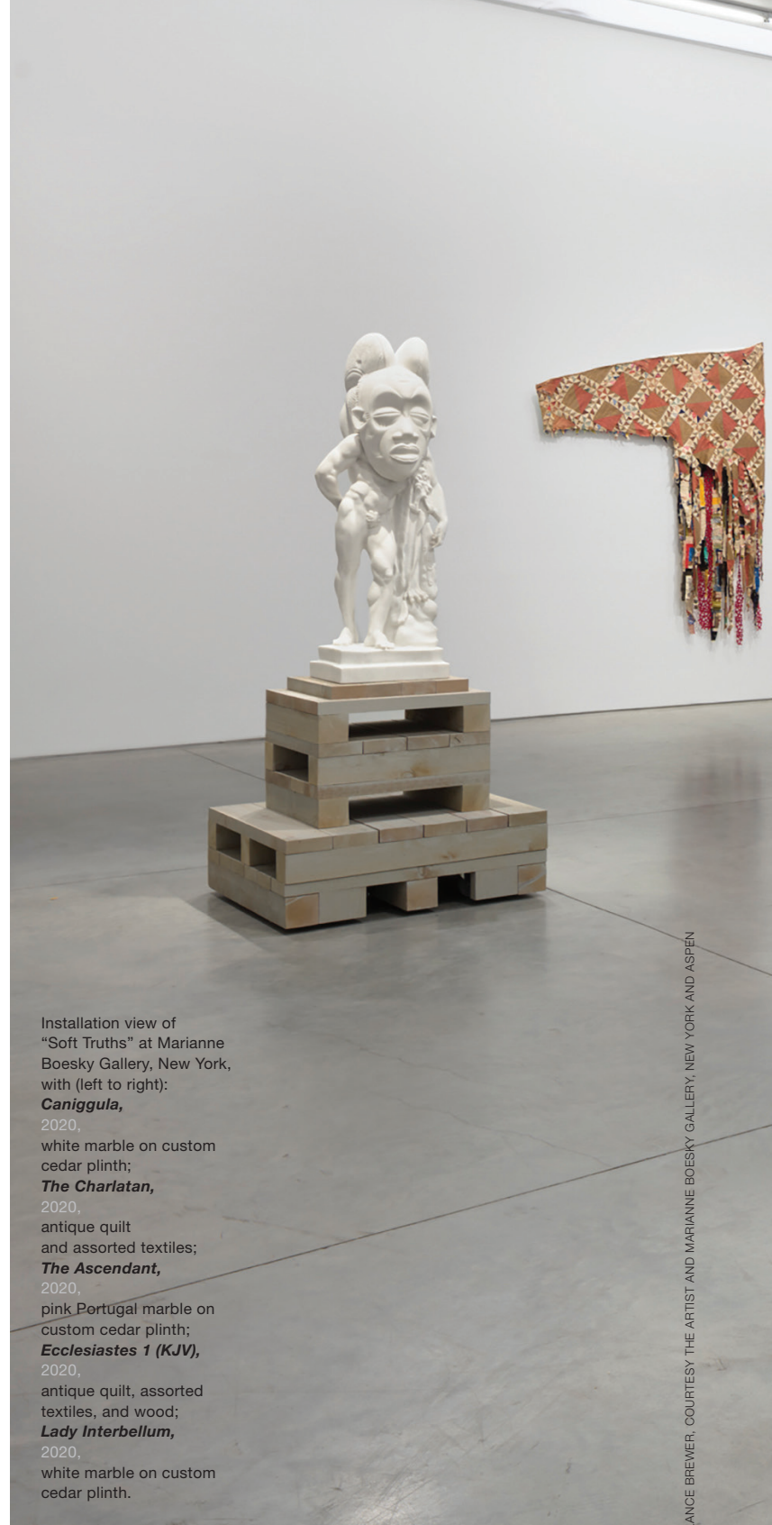
Installation view of “Soft Truths” at Marianne Boesky Gallery, New York, with (left to right):