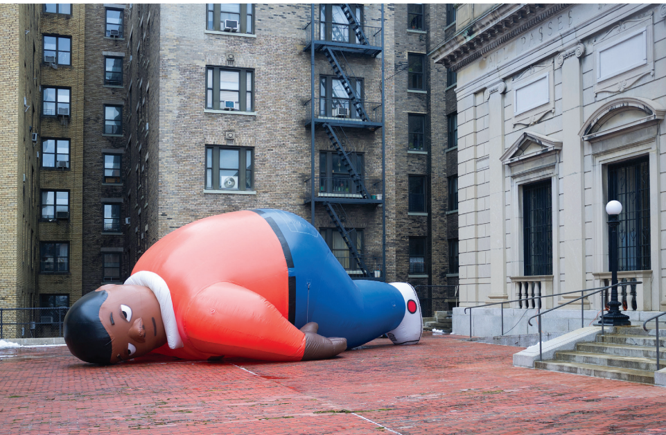
ABOVE: Laocoön (Fatal Bert), 2016. Vinyl and electric air pump, 240 x 348 x 140 in.