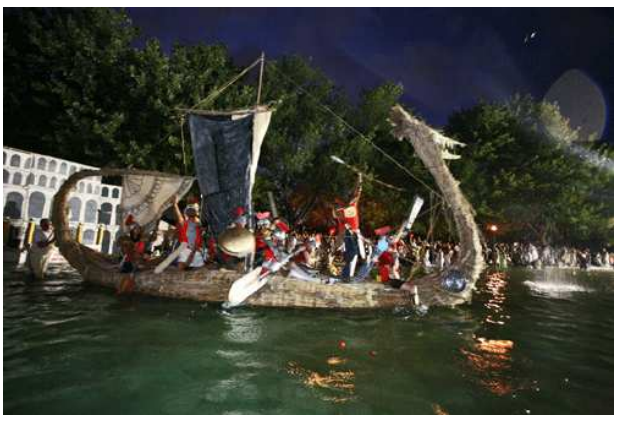
Those About to Die Salute You (Performance Detail: The Queens Museum of Art Vessel). Local invasive reeds, trash, materials salvaged from the former World's Fair Ice Skating Rink, participants, 2009.

You in which fleets of homemade boats and toga-clad warriors from museums from all five boroughs duked it out, shooting fireworks and slinging microwaved tomatoes from boats in a flooded Flushing Meadows 1964 World's Fair fountain.