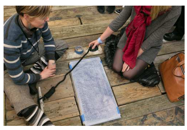
Duke's Riley's Rubbing Studio at the 100th Armory Show, NYC, 2013.

Nothing screams "America" as boldly as Duke's combination of installation, arcane tales from the underbelly of American history, humor, invention, and lots of sex, drawing, and fabrication materials right out of Wild West tales, including wood, nails, cigarettes, and rope. His driftwood studio floor, gathered after he volunteered to help Superstorm Sandy victims in the Rockaways, was thick planks of aged, multihued wood plus a few colorfully-inscribed planks from the old Rotgut bar counter. Set into the center of this square floor was an incised granite stone commemorating the Silk Stockinged Stowaway who landed on Pier 94 on November 30, 1934 – a tale tied to the pier housing the Armory show. A rectangular wooden crib recessed into the floor held 700 sheets of cobalt-blue, wax-coated rubbing paper. A monkey's fist knot – a thick ball of knotted rope — was tied to a metal cleat normally used to moor boats. By taping the paper against the granite stone and rubbing it with the knot, 700 people knelt down, rubbed the stone, and made their own prints. Duke numbered, signed, and gave away 700 real art works at the multibillion dollar 5-day all-over-town art fair spending spree called The Armory. The free art was revolutionary!