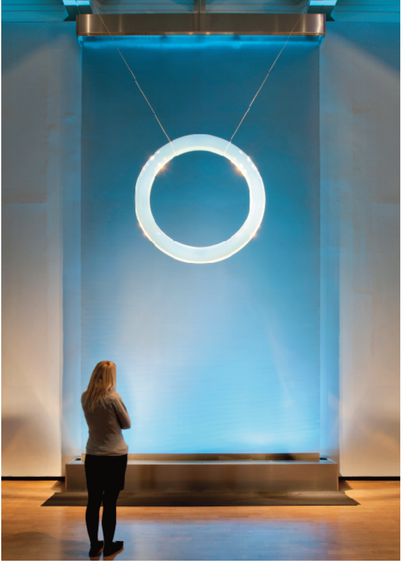
Ring , 2012. Lucite and stainless steel cables, 3 x 49.5 in. diameter.

© MARIKO MORI, COURTESY ROYAL ACADEMY OF ARTS, LONDON