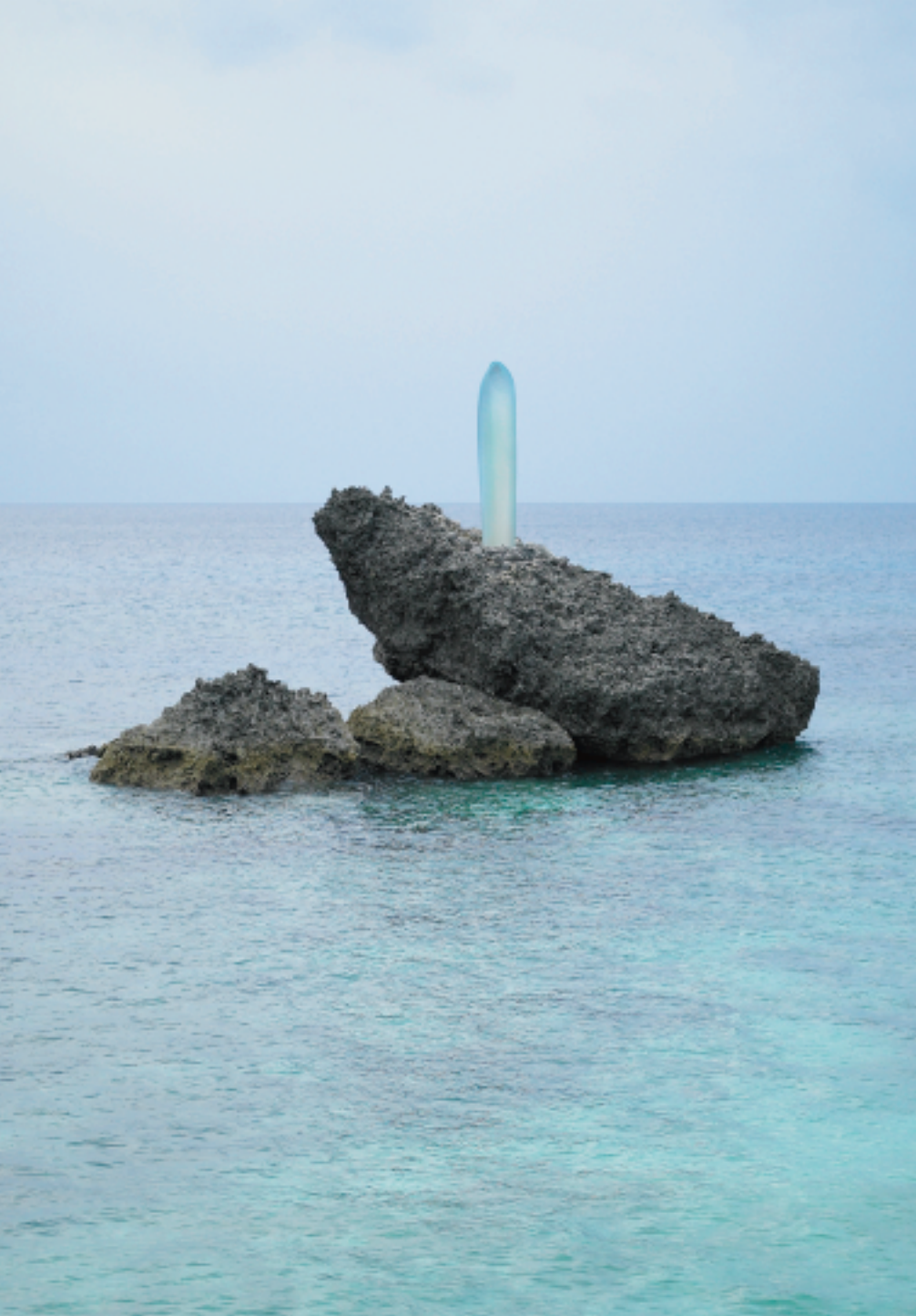
Top: Sun Pillar , 2011. Layered acrylic, 157 in. high. Bottom: Moon Stone (video still of work-in-progress), 2015.

Then, by searching for deeper consciousness, I began to relate it to science, which led to the idea of dark matter, dark energy, extra dimensions, primal particles, and the discovery of neutrinos.