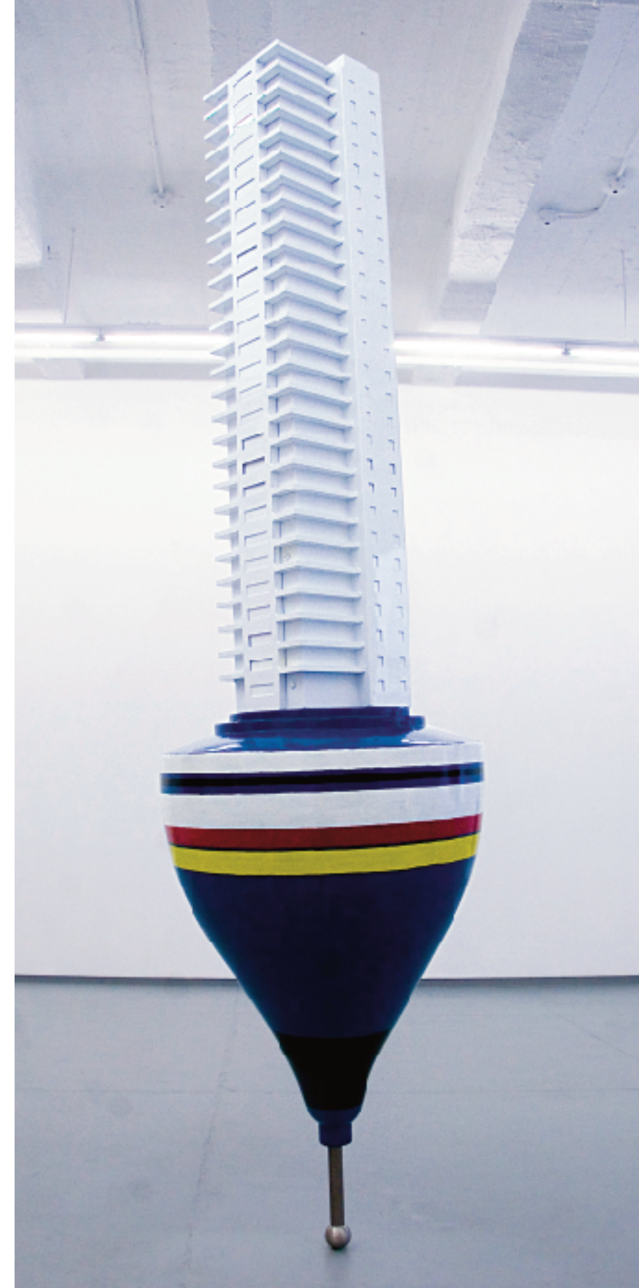
Someillan , 2010. Aluminum, wood, and resin, 84 x 43 in.