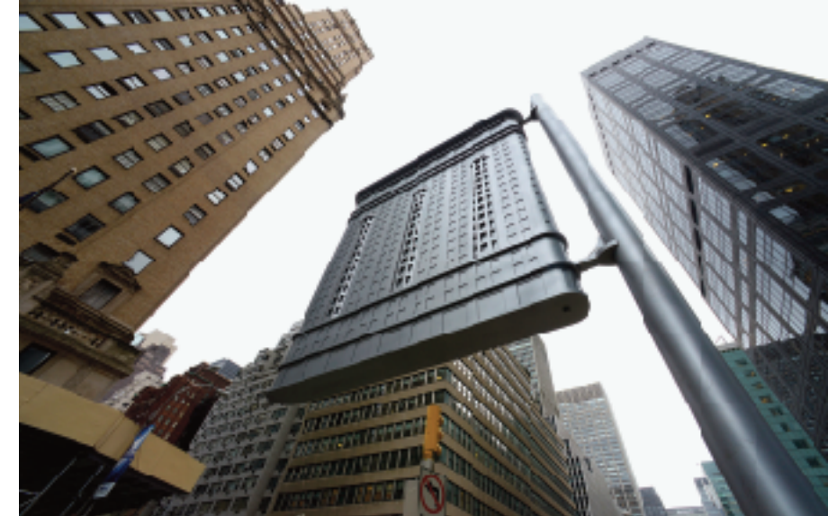
Right: Flatiron , 2013. Aluminum, 18 x 6.5 x .75 ft. Center right: Seagram , 2013. Steel, 20 x 9.4 x 3.3 ft. Bottom right: Empire State , 2013. Steel, 15 x 10 x .9 ft.