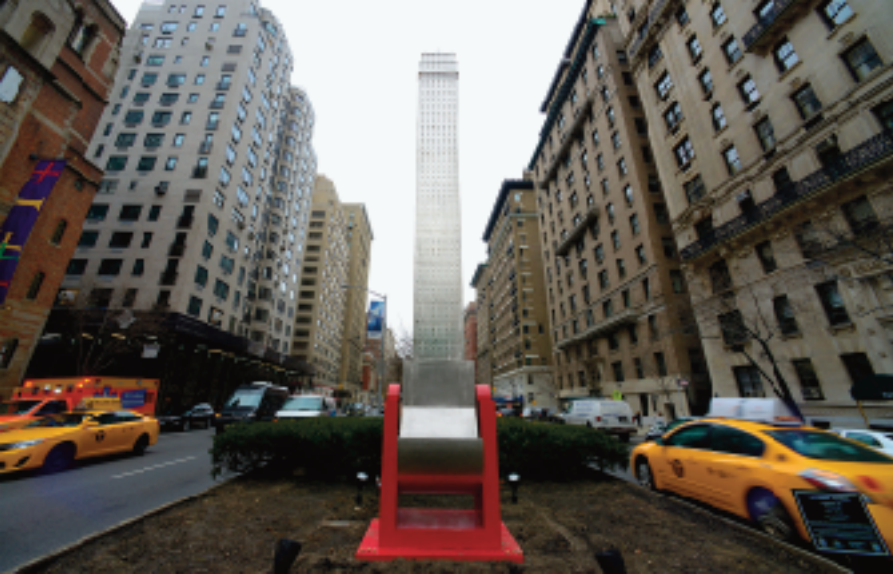
Left: Courthouse , 2013. Aluminum and steel, 20 x 4.3 x 3 ft. Center left: Helmsley , 2013. Steel, 15 x 14.5 x 2.6 ft. Bottom left: Citigroup , 2013. Foam, polyurethane, and steel, 16.5 x 6 x 2 ft.

It resembled a sort of traffic barrier closing the entrance at Park and 60th Street. It leans to the right to show that law and order can collapse.