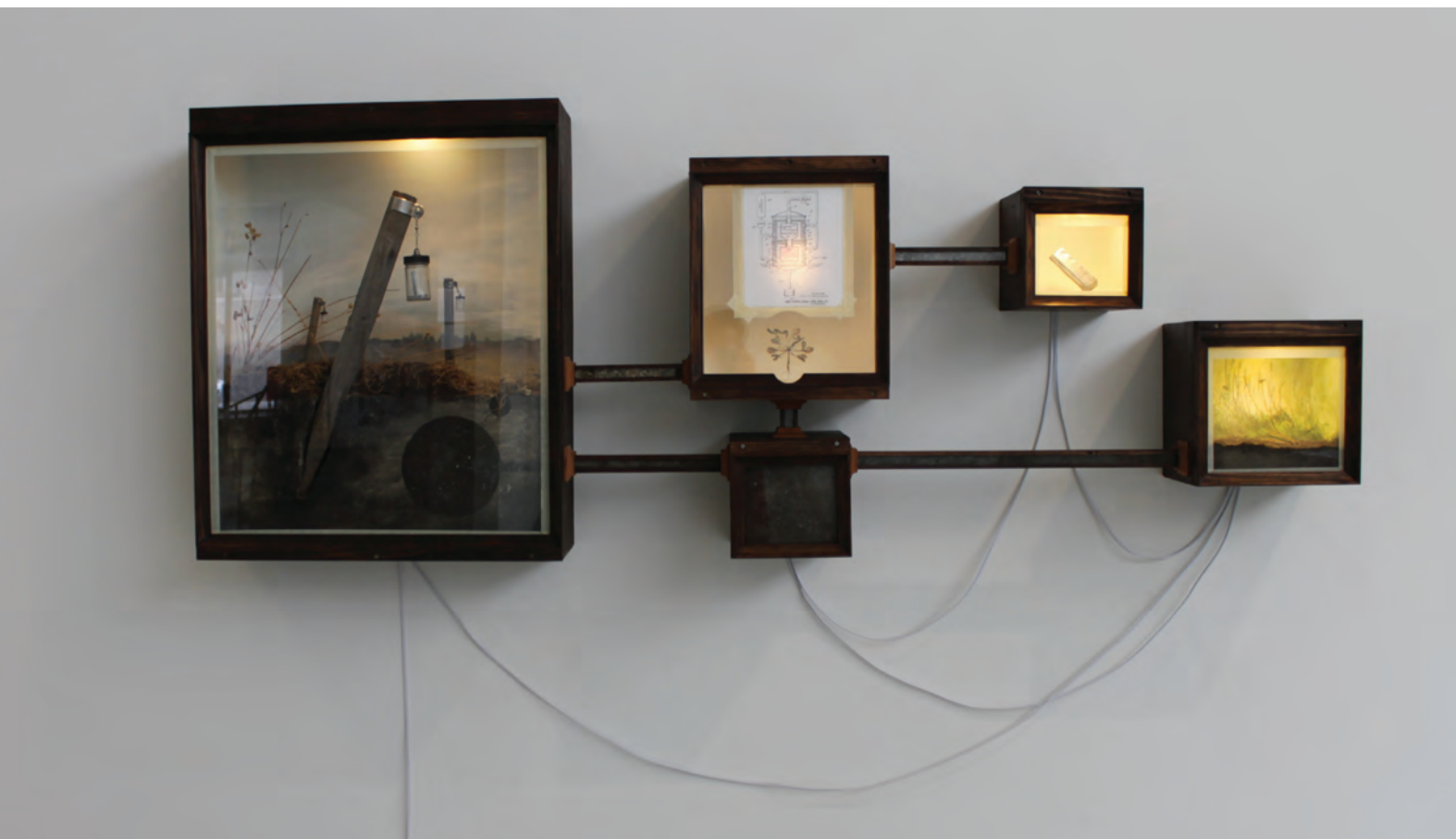
THIS PAGE, TOP: THOMAS REHBEIN GALERIE, COLOGNE, COURTESY THE ARTIST / BOTTOM: COURTESY THE ARTIST / OPPOSITE: COURTESY THE ARTIST