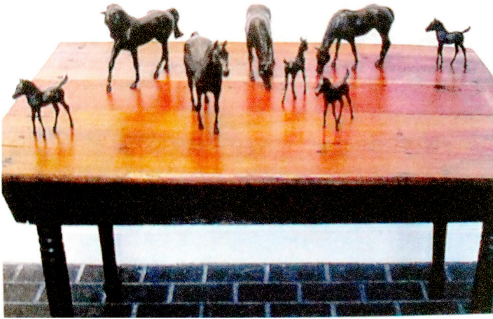
The Domain of Perfect Affection , 1999. Wax and pine table, 40 x 48 x 30 in.

PC: The learning curve is high. A very good carver from Russia taught me as we went along. Each carver has his or her own specialty: roughing out, undercutting, decorative details, or polishing. I got a fast education.