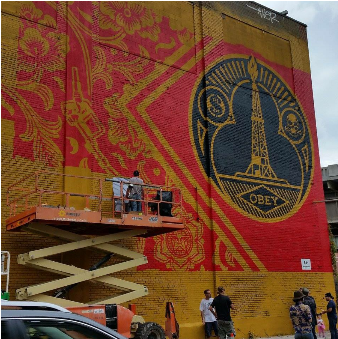
Shepard Fairey mural installation, New York, September, 2015