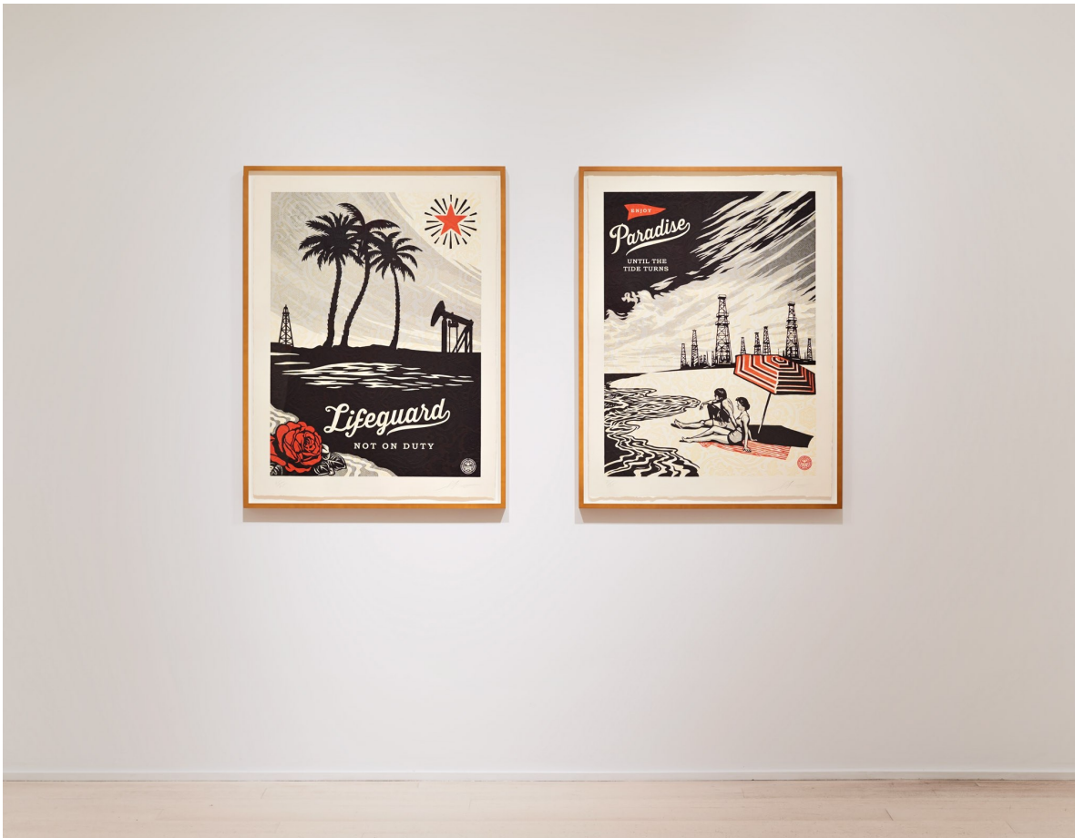
Shepard Fairey, Lifeguard Not on Duty, (left) HPM, 2015, 2 color relief print on hand-painted material, 41 x 30 inches, Edition of 5. Paradise Turns, (right) HPM, 2015, 2 color relief print on hand-painted material, 41 x 30 inches, Edition of 5.

I've been called a propagandist, but a propagandist says, "This is the final take on the conversation." My work is about starting the conversation. I have strong opinions, but I'm always finding out more about things, and my positions have evolved over the years.