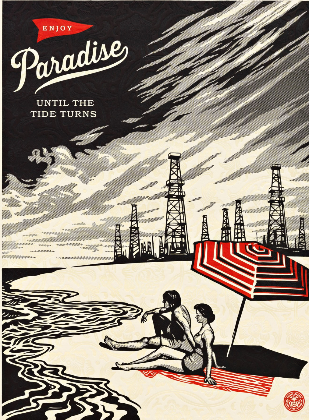
Shepard Fairey, Paradise Turns , 2015, Set of three three-color reliefs on handmade paper, 40 1/2 x 30 1/2 inches each Edition of 25. Courtesy of Pace Prints