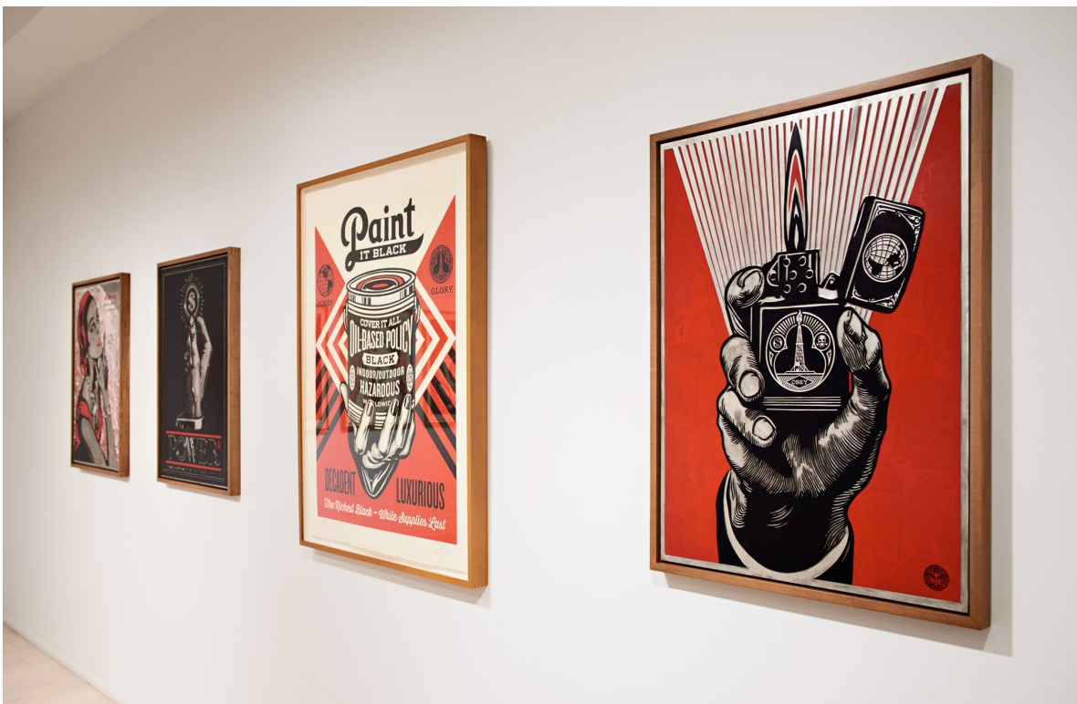
Shepard Fairey installation view 2015, Pace Prints Chelsea, New York, NY

Fairey's imagery is complex and, as he says, is intended to start conversations. His layered backgrounds remind me of Jasper Johns flags, of Picasso's and Braque's collages, and of old Charles Birchfield wall paper and visionary landscapes, and poster artists of past decades. Some originals use Rubyliths – a red photographic blockout film used in the early commercial platemaking days. This is one of many examples of the ways Fairey uses hand cut materials to point to processes that are part of early printmaking.